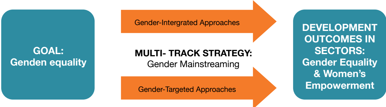
Figure 1. UN Women's multi-track strategy for gender mainstreaming